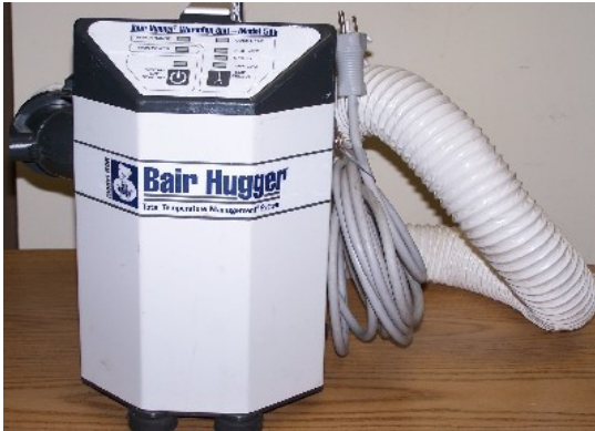
Figure 2. Forced air warming blanket

Active warming using forced air warmers such as the “Bair hugger” illustrated below are devices that blow hot air into a blanket on top of the patient. It is more efficient than passive warming and prevents heat loss both by convection and radiation. These warmers must be used with the correct blankets to prevent thermal injury.