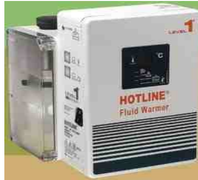
Figure 3. Intravenous fluid warmer

Use warmed irrigation fluids. Connect a blood and fluid warmer if large amounts of fluid and blood product use are anticipated. Warm and humidify Inspired gases may be warmed by using a heat and moisture exchange device.